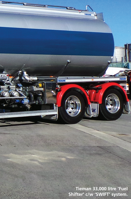
Tieman 33,000 litre 'Fuel Shifter' c/w 'SWIFT' system.