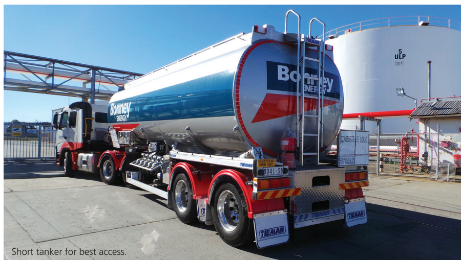
Short tanker for best access.