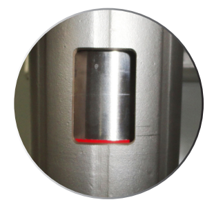
RED SHOWING API coupler requires servicing