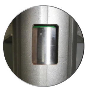
GREEN SHOWING API coupler suitable for continued use